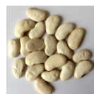
1. 50 beans