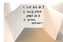
3. Breeding ground screens